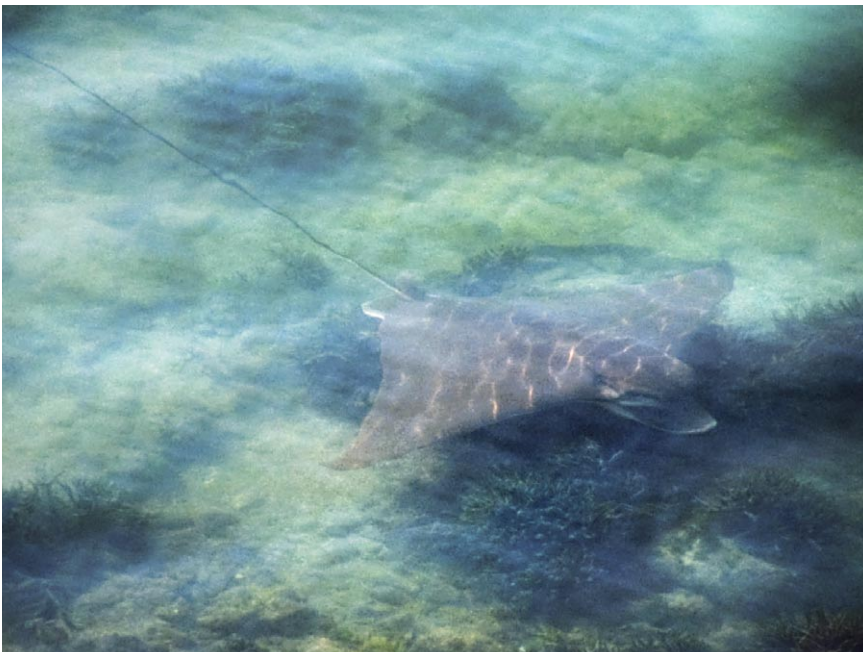
Fig. 3: Perhaps an adult female due to lack of conspicuous whitish pre-orbital horns.