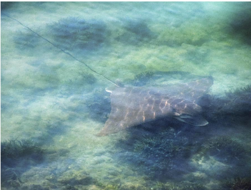
Fig. 3: Perhaps an adult female due to lack of conspicuous whitish pre-orbital horns.