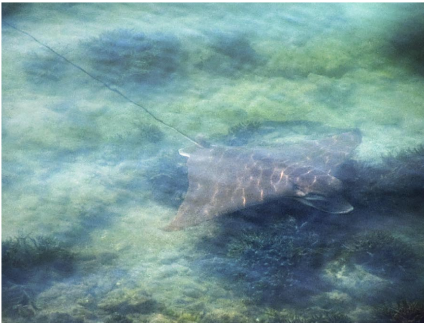
Fig. 3: Perhaps an adult female due to lack of conspicuous whitish pre-orbital horns.