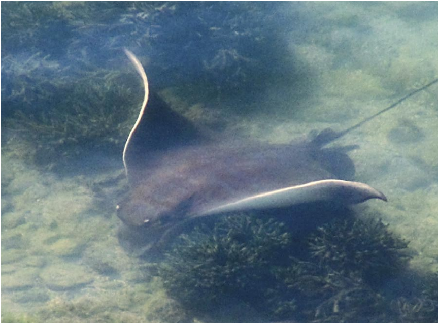
Fig. 2: Adult male showing conspicuous whitish pre-orbital horns.