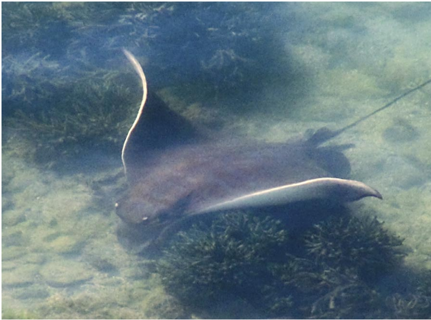
Fig. 2: Adult male showing conspicuous whitish pre-orbital horns.