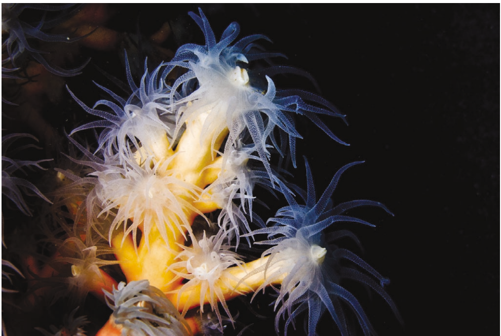
Fig. 3: Detail of the expanded polyps of D. ramea.