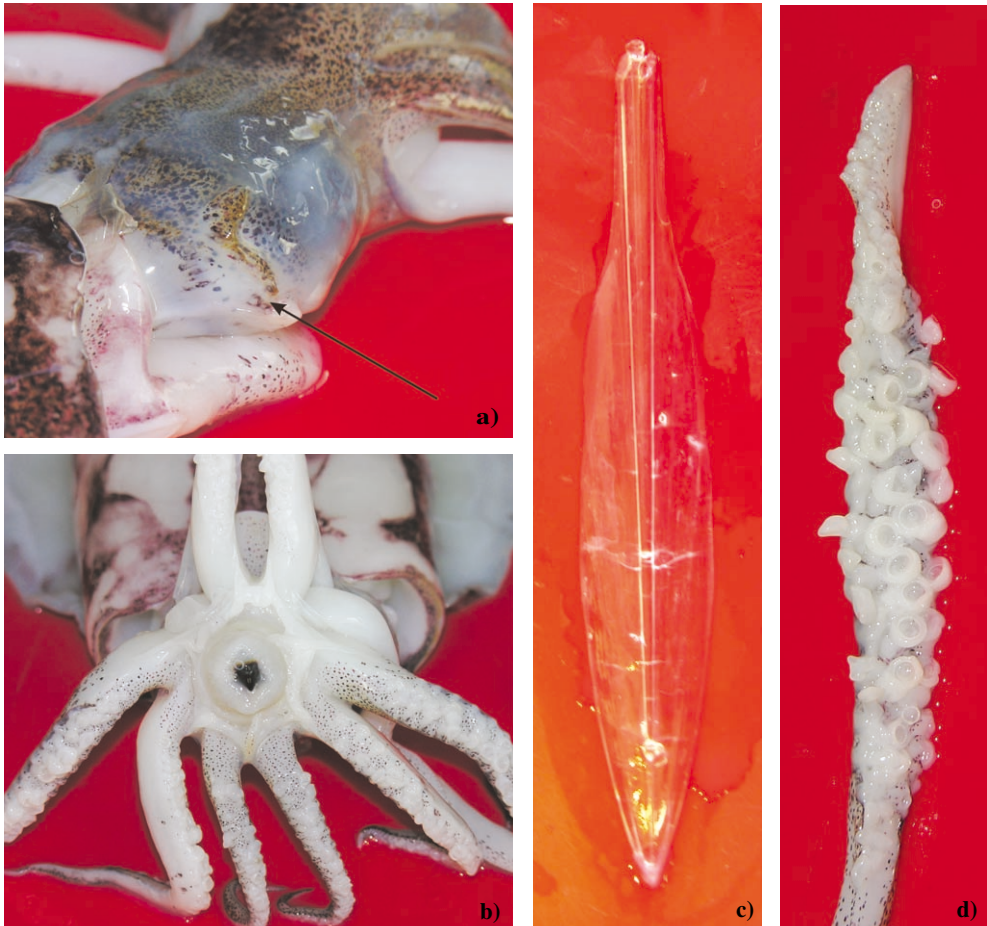
Fig. 3: (a) Head (arrow showing the cartilaginous lamella under the eye), (b) Buccal mass and crown, (c) Gladius, (d) Tentacular club of Sepioteuthis lessoniana from the Aegean Sea.