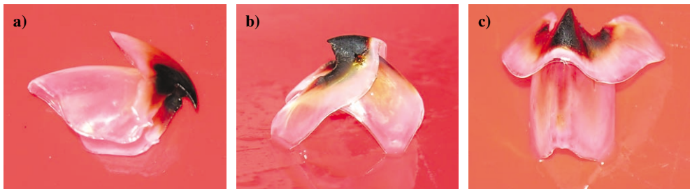
Fig. 5: (a) Lateral view of the upper beak, (b) lateral and (c) ventral view of the lower beak of Sepioteuthis lessoniana from the Aegean Sea.

same species collected from various areas of the Indo-Pacific Ocean (Table 3), confirms the identification of the specimen caught near the coast of Rhodes. The other two valid species of the genus Sepioteuthis , S. australis and S. sepioidea apart from the morphological differences, the most evident of which are the relatively narrower fin and the less extended tentacular club, are distributed in faraway geographic areas (Australian waters and the central area of the Western Atlantic respectively) (ROPER et al. , 1984), so that any suspicion of their migration to the Mediterranean Sea can be dismissed.