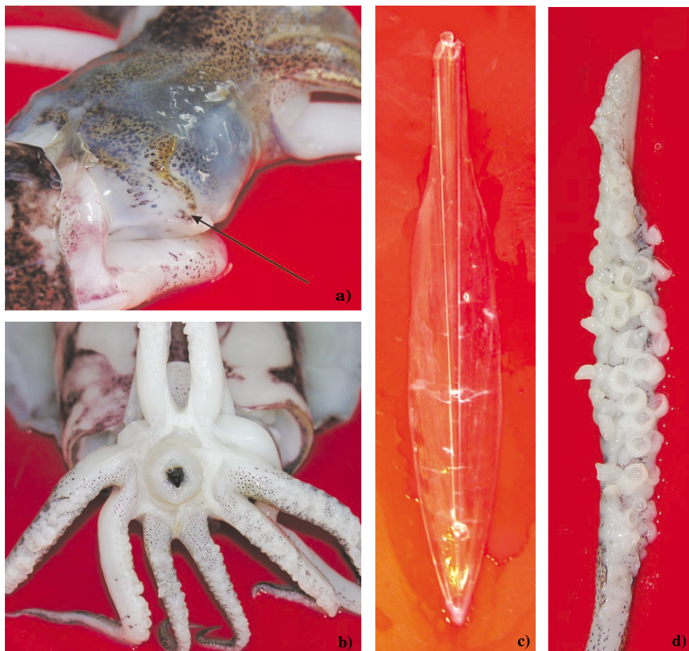
Fig. 3: (a) Head (arrow showing the cartilaginous lamella under the eye), (b) Buccal mass and crown, (c) Gladius, (d) Tentacular club of Sepioteuthis lessoniana from the Aegean Sea.