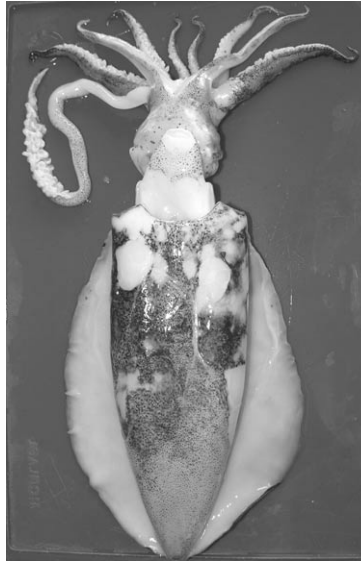
Fig. 2: Ventral view of Sepioteuthis lessoniana from the Aegean Sea.

Suckers: horny rings of both arm and tentacular club suckers bear sharp triangular teeth around the entire margin, those in the tentacular club suckers more sparsely positioned (Fig. 4).