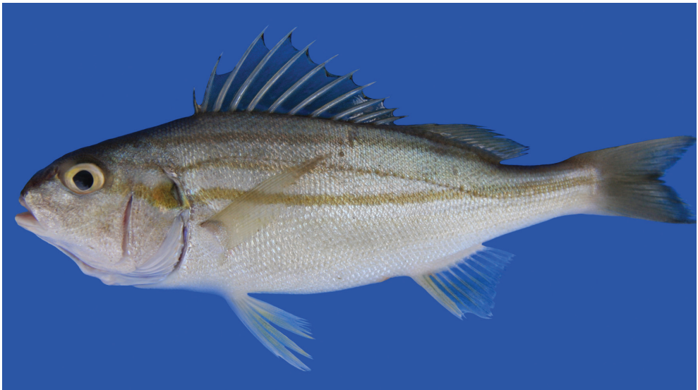
Fig. 2: Pomadasys stridens (Forsskal, 1775), 12.8 cm SL, Adana/Turkey.

preanal length 39.3, head length 10.4, body depth 4.3, all as a percentage of total length. Eye diameter 8.9, snout length 16.9, all as