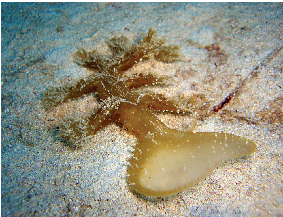
Fig. 2: Underwater photograph of a feeding Melibe viridis from western Comino, Maltese Islands, taken by Sarah Gauci Carlton on 30th September 2008 at a depth of 20 m. The animal in the photograph is about 16 cm long (© Ecoserv 2008).

The specimens observed occurred on a bottom of gravelly sand with small stones and pebbles at a depth of 18-20 m. Sparse patches of Cymodocea nodosa were present in the vicinity but none of the specimens were recorded from amongst the seagrass. The individuals observed ranged in length between 8 cm