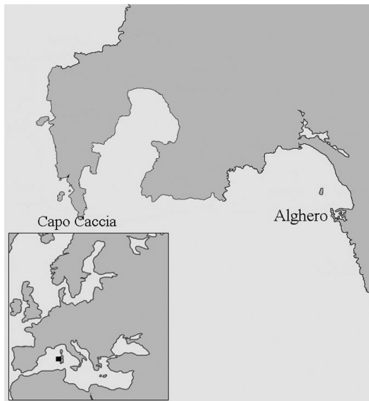
Fig. 1: Capo Caccia (Alghero) 40°33'39"N 8°09'50"E.

and then, on the boat, were cleaned of the rocky bottom on which they grow and put in a bowl. From 2002 to 2005 about 150 kg of red coral colonies have been analyzed and the molluscs on that coral harvested.