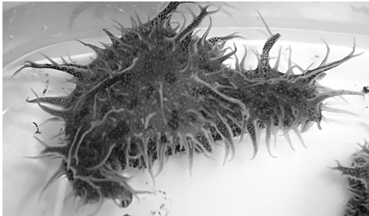
Fig. 2: Dorsal view of Bursatella leachii .

Izmir is the third biggest and one of the most important commercial and industrial cities in Turkey. In addition, Izmir Bay provides a major contribution to the economic development of not only Izmir, but also to the Aegean region of Turkey. On the other hand, due to the many factories producing food, dyes, chemicals, textiles and metals, as well as domestic waste water, up to 2000 the bay has been exposed to heavy pollution (KUCUKSEZGIN et al. , 2006; ÇINAR et al. , 2008). In 2000 the Izmir municipality developed a project called 'The Grand Canal Project' to prevent the flow of pollution into the bay. Current studies on pollution in the bay report that the primary pollution factors are now nutrients and/or organic matter rather than heavy metals (KUCUKSEZGIN et al. , 2006; ÇINAR et al. , 2008).