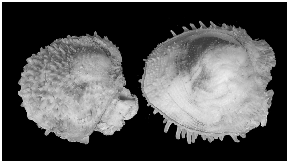
Fig. 1: Chama aspersa (size: 20mm).

The present findings increase the number of alien mollusca in Greek waters from 33 (ZENETOS et al. , 2005b; PANCUCCI-PAPADOPOULOU et al. ,