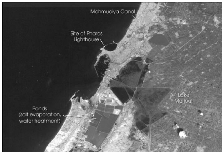
Fig. 1a: A space image of Alexandria City and its Lake Maryout (Main Basin), Omoum Drain, and Mex Bay.