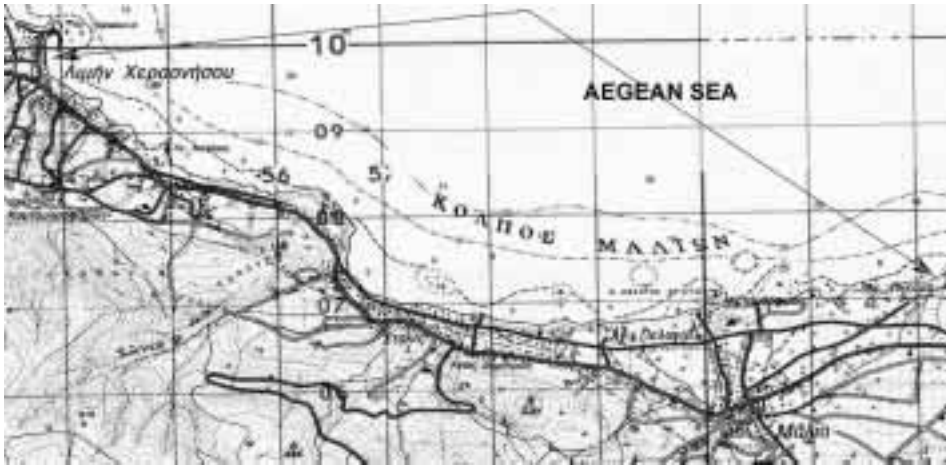
Fig. 1: The study area of Hersonissos (Crete, Greece). The scale is arbitrary.

In order to assess the impacts of the inundation of the coastal zone due to sea level rise, the following geoinformation was used: