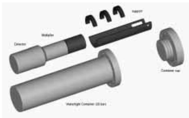
Fig. 2: The watertight cylindrical casing, which houses the sensor, the photomultiplier and the appropriate sled.

The calculation of O-rings' parameters (diameter, thickness, material, hardness, groove dimensions, maximum gap etc.) was performed, following the suggestions of the Seal Design Guide from Apple Rubber Products Inc. (APPLE 1989) The enclosure's 3D artistic picture can be seen in Figure 2. For easy mounting of the sensorial, the unit (sensor