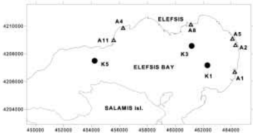
Fig. 1: Map of Elefsis Gulf and locations of BPCEQ marine pollution sampling points. (Map scale: 1:150000, Greek Coordinate system EGSA 87).