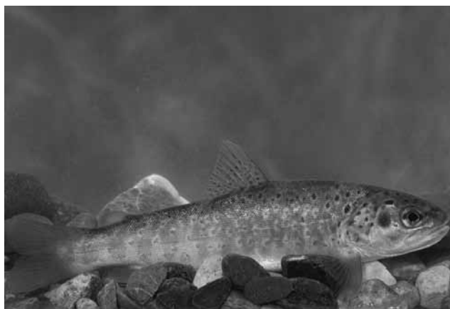
Fig. 3: Unidentified trout specimen, Salmo sp., collected at Gorgopotamos, Sperchios Basin.