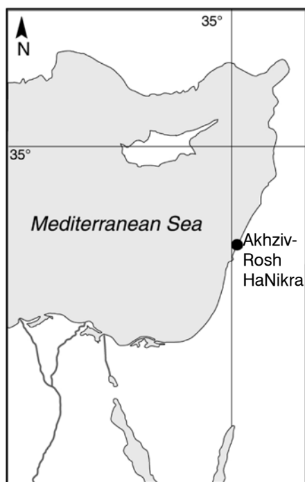
Fig. 1: Map showing the location of the sampling area on the Akhziv – Rosh HaNikra coast, Northern Israel, eastern Mediterranean.

d'Orbigny studied came from Mauritius, western Indian Ocean.