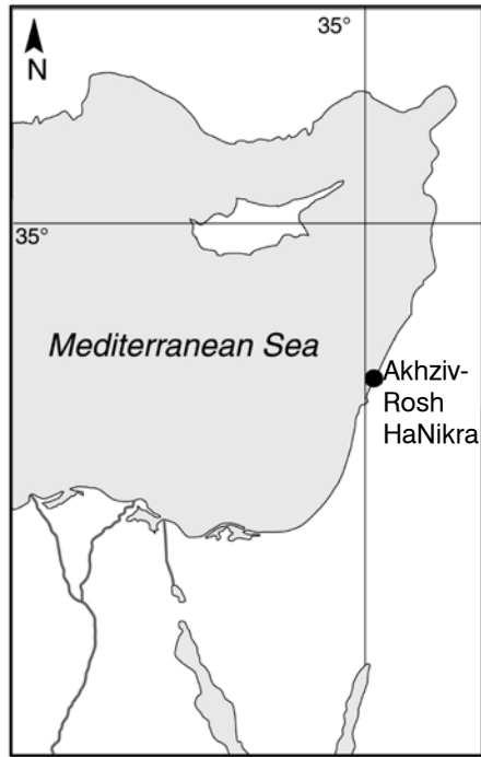
Fig. 1: Map showing the location of the sampling area on the Akhziv – Rosh HaNikra coast, Northern Israel, eastern Mediterranean.

d’Orbigny studied came from Mauritius, western Indian Ocean.