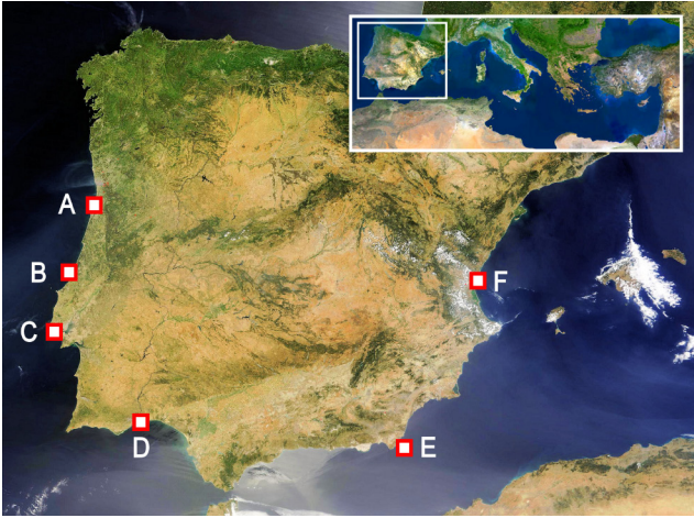
Fig. 1: Diopatra micrura - current distribution along the Iberian Peninsula. Portuguese sites: A: Aveiro estuary; B: Nazaré; C: Tagus estuary; D: Guadiana estuary (Pires et al. , 2010). Spanish sites: E: Gata Cape; F: Valencia Harbour.

ited at the National Museum of Natural Sciences, Madrid, Spain (MNCN 16.01/11627-16.01/11631) were examined to confirm identification of the Cape Gata specimens.