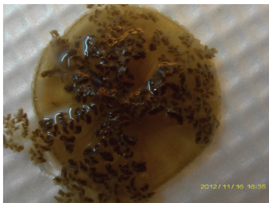
Fig. 6: Cassiopea andromeda collected near Lattakia Port, Syria.

Two young C. andromeda specimens (Fig. 6), 5 cm in diameter, were caught in the coastal waters of Lattakia, about 6 km north of Lattakia port (35°33'48.91" N, 35°43'2.30" E), on 16 November 2012. The temperature and salinity at the sampling time were 21°C and 39 ‰, respectively. The two specimens were collected at depths of 0.5 and 3 m, they were photographed, fixed in 4 % formaldehyde, and stored at the zooplankton laboratory of the High Institute of Marine Research, Tishreen University (Syria).