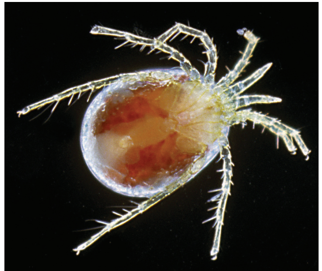
Fig. 8: Pontarachna adriatica female from Piran Bay.

The specimen collected from Piran Bay (Fig. 8) is in good agreement with the original description (Morselli, 1980). In addition, we provide some measurements of the specimen from Piran Bay, which represent the first record of this species found in a gut of a fish from Slovenia.