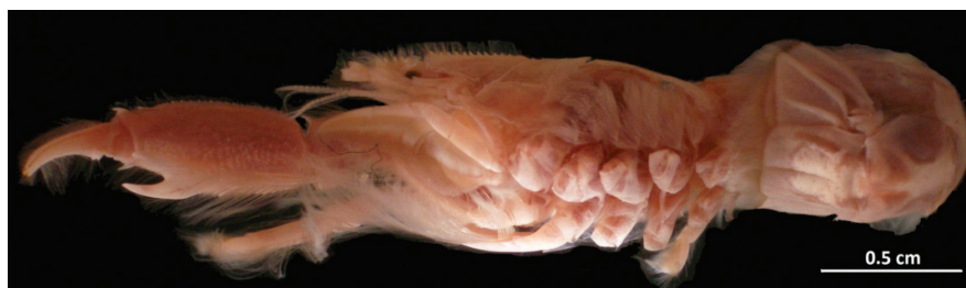
Fig. 4: General view of Gebiakantha talismani , found in Akkuyu, Mersin.

Available information on the thalassinid crustacean fauna of the Turkish Seas is relatively restricted compared to other parts of the Mediterranean. Nevertheless, Ateş et al. (2010), compiling the updated list on Turkish decapod crustaceans, have added five thalassinid species. In June 2012, two individuals of Gebiakantha talismani (Bouvier, 1915) were collected during a grab (0.1 m 2 ) survey cruise along the Turkish Mediterranean coast, the Akkuyu coast of Mersin specifically (36° 11' 45" N and 33° 53' 29" E). A Van Veen grab was used at depth of 78 m on a mud bed covered with mollusc shell remains. The specimens were photographed (Fig. 4) and deposited in the invertebrate collections of the Hydrobiology Department, Faculty of Fisheries, Sinop University with catalogue code: SNU-FF/CRS/2012-01. Ngoc-Ho (2003) reported that this thalassinid species was found on the soft-bottoms (muddy sand) with shells at depths between 20 and 150 m. Likewise, another specimen was found on a bottom with shell remains at a depth of 155 m in southern Spain (García Raso, 1996). According to Ngoc-Ho (2003), the general distribution of the species is along the Central Mediterranean (Malta), Eastern Mediterranean (Lybia and Greece) and northwest coast of Africa, from Morocco to Congo. This is the first record of the genus Gebiakantha from Turkey and, based on this reference, the number of thalassinids in the Turkish seas has increased to six.