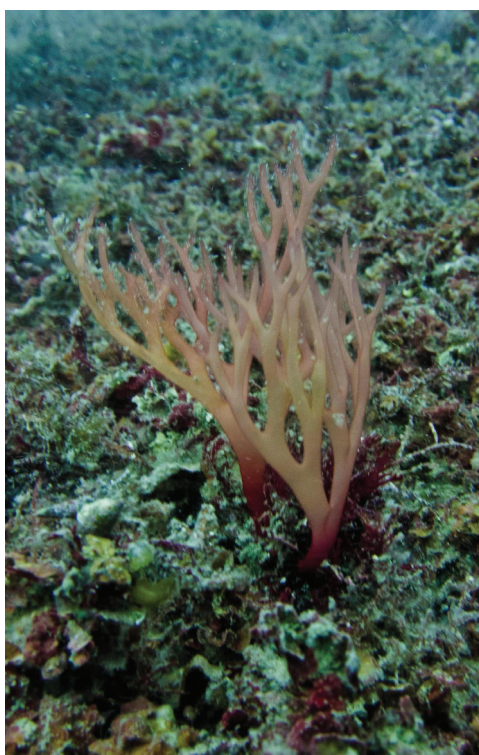
Fig. 2: Sebdenia dichotoma in the field.

Thalli were erect, up to 7 cm in height, reddish, cartilaginous, smooth, rising from a basal disc; fronds slightly