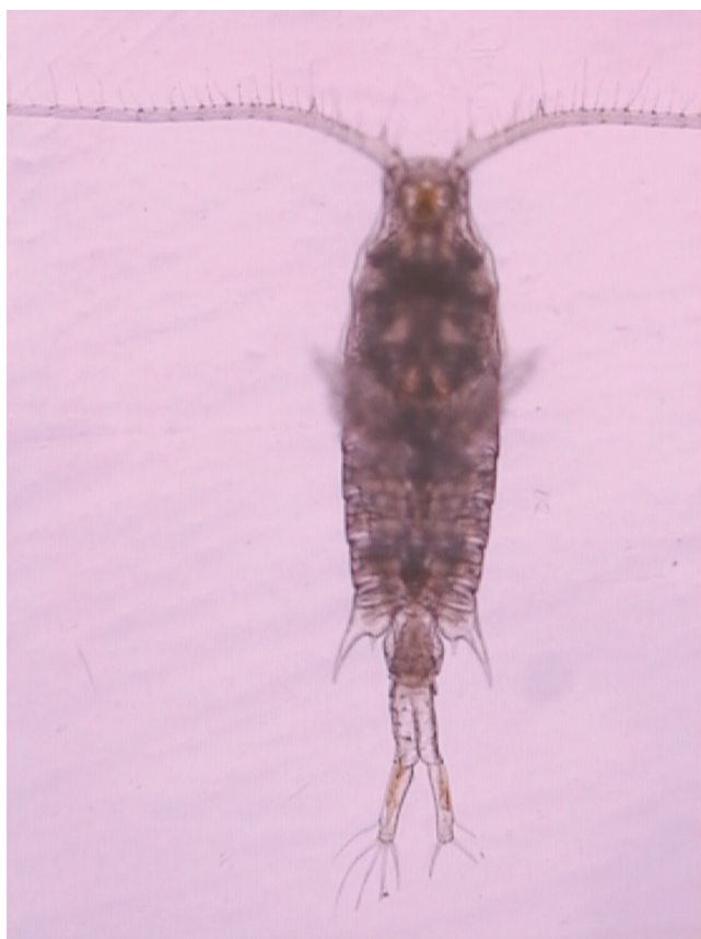
Fig. 11: Centropages furcatus female collected in the Aegean Sea.

The calanoid copepod Centropages furcatus is a cosmopolitan epipelagic species inhabiting mainly the equatorial and subtropical zones (Razouls et al. , 2005-2012). In the Mediterranean Sea, it was firstly recorded in the waters off Lebanon, considered as a Lessepsian immigrant (Lakkis, 1990), and its presence is most important in the warm period (Lakkis, 1995). In September 1988, one specimen of the species was found in the upper 50 m layer of a station positioned at 36° N and 29°30' E (NW Levantine Sea), (Siokou-Frangou et al. , 1999). The study