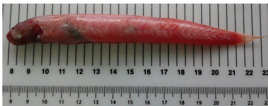
Fig. 3: Trypauchen vagina caught in North-eastern Mediterranean Sea, Turkey.

One T. vagina specimen was collected by a commercial trawler on 28 October 2012 on the Anamur coast-Mersin Bay, Turkey (35°53'28"N, 33°09'19"E) at a depth of 25-30 m. The specimen (Fig. 3) was deposited in the fish collection of Duzce University, Faculty of Art