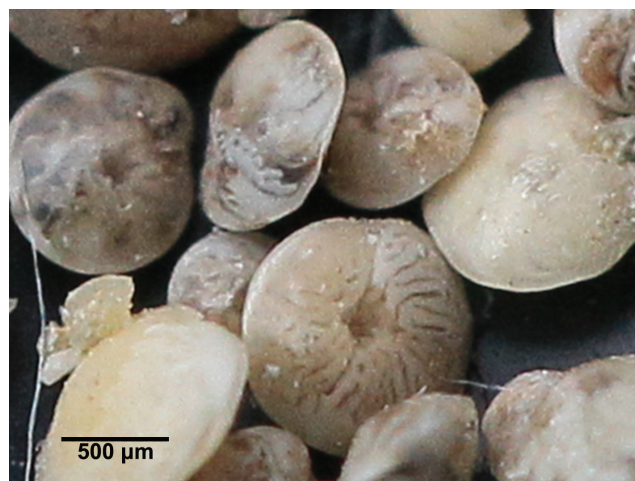
Fig. 7: Amphistegina lobifera from Zakynthos.

Amphistegina lobifera (Fig. 7) was collected from northern Alykanas bay (37.53 N, 20.45 E, NE Zakynthos island, Ionian Sea) on July 2012. It was found in algal material collected at a water depth of less than 0.5 m. During the study period, mean monthly sea surface temperature and salinity reached 24.1°C and 38.56 ‰ respectively. The species dominated the algal foraminiferal popula-