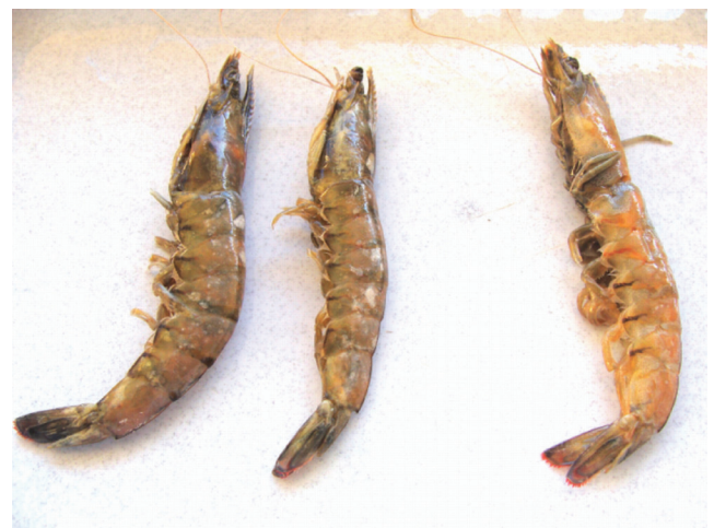
Fig. 5: Three individuals of Melicer-tus hathor caught in the Kastellorizo Island area.

Three individuals (two males and one female) were caught on a 10-20 cm deep sandy bottom, using a brail