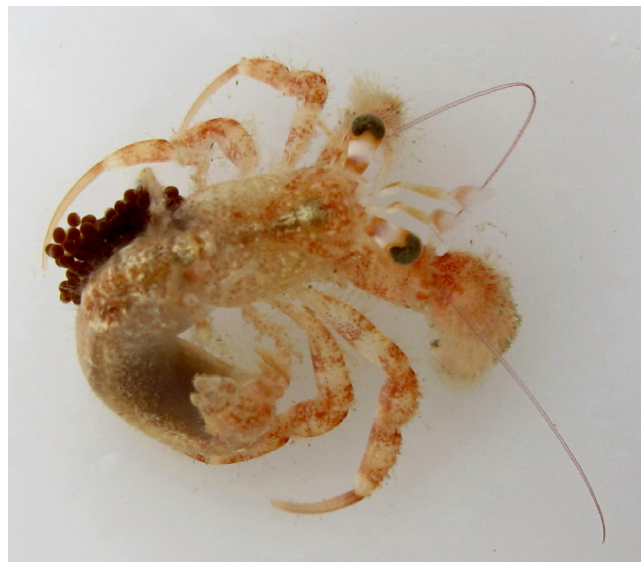
Fig. 3: Live ovigerous female Pagurus mbizi .

decapods found in these samples were the hermit crabs Anapagurus laevis (Bell, 1845), Pagurus prideaux and Pagurus excavatus ; all of them typical species of continental shelf muddy bottoms. The gastropod shell inhabited more frequently by P. mbizi was Nassarius denticulatus (Adams, 1852).