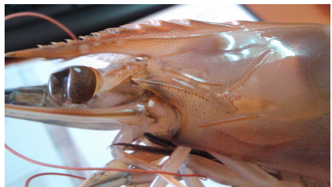
Fig. 2: Farfantepenaeus aztecus (Ives, 1891), adult female, Boka Kotorska Bay, Montenegro. A: lateral view, B: dorsal view of carapace (Photo: Olivera Marković).

ing far beyond the epigastric tooth, gastrofrontal carina present; postorbital spine absent; antennal and hepatic spines pronounced; first three pairs of pereiopods terminate with a chela; first pereiopod with a spine on ischium and basis and second pereiopod with a spine only on basis; three short well-defined cicatrices on the sixth abdominal somite and one small on the fifth abdominal somite; dorsolateral sulcus on the sixth abdominal somite and telson unarmed.