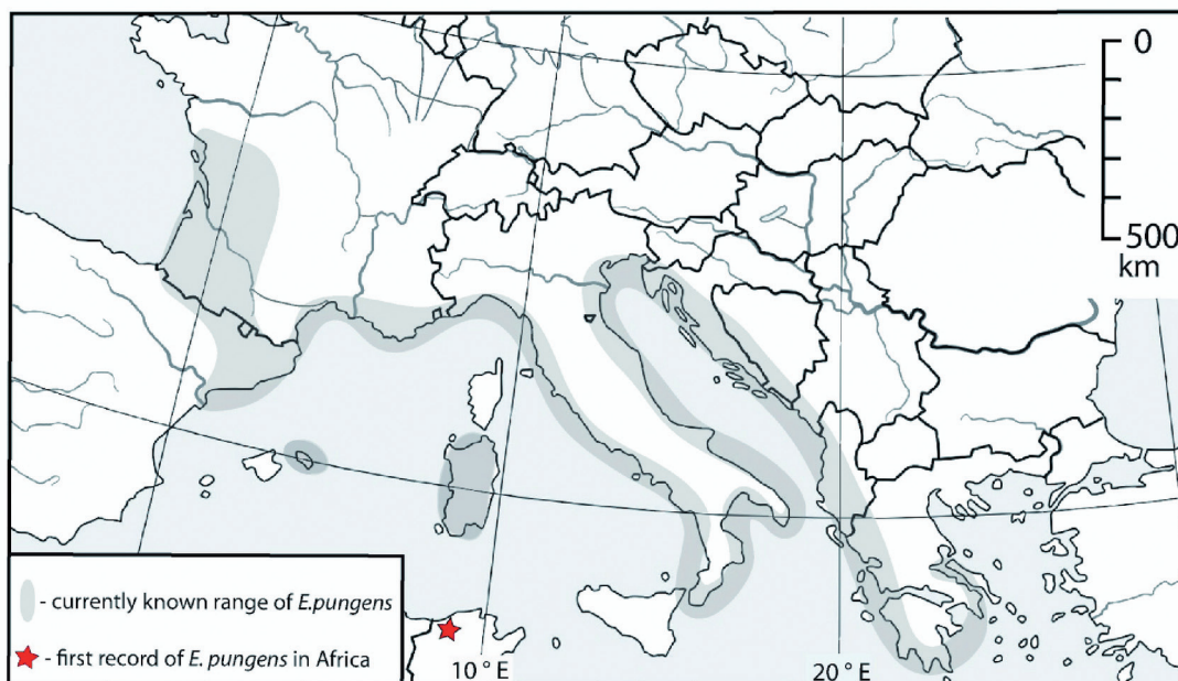
Fig. 1: Geographical distribution of Echinogammarus pungens .

Diagnosis of Tunisian male specimens: All the morphological features described below are illustrated in Fig. 3. Medium large species, the maximum length of males