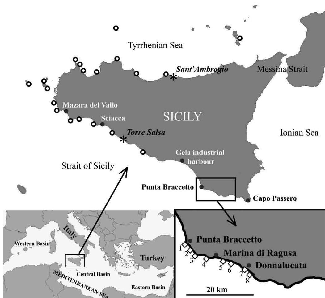
Fig. 1: Map of the study area. Circles represent surveyed sites where Caulerpa taxifolia var distichophylla was not observed, diamonds represent 8 invaded sites where the alga was monitored in 2012 and 2013 in the invaded area, and asterisks represent new records outside the invaded area.

In order to get a quick estimation of the effects of the alga invasion on the resident benthic assemblages, polychaetes were analyzed at family level following