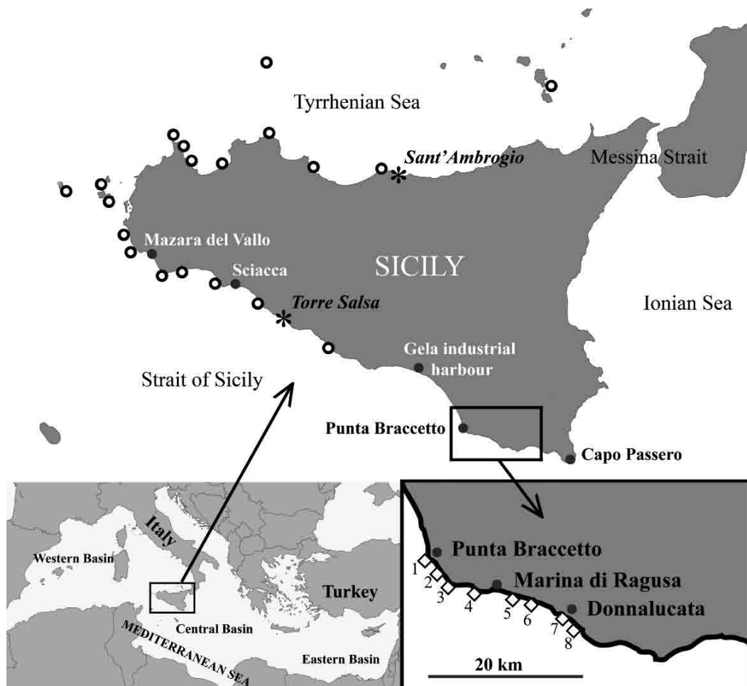
Fig. 1: Map of the study area. Circles represent surveyed sites where Caulerpa taxifolia var distichophylla was not observed, diamonds represent 8 invaded sites where the alga was monitored in 2012 and 2013 in the invaded area, and asterisks represent new records outside the invaded area.

In order to get a quick estimation of the effects of the alga invasion on the resident benthic assemblages, polychaetes were analyzed at family level following