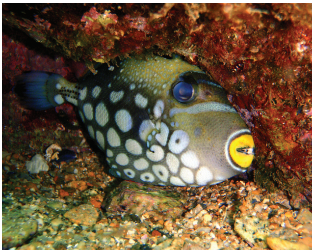
Fig. 2: Balistoides conspicillum (Bloch & Schneider, 1801) photographed off Palamós (Catalan Sea, Spain) on July 2012 at a depth of 3 meters.

lan Sea. In November 2012, one specimen of Abudefduf saxatilis was spotted along the coasts of Palamós by a recreational diver (Azzurro et al. , 2013). In December 2007, also at Palamós (Morro de Vedell creek: Cala Margarida), a single specimen of the Lessepsian Fistularia commersonii Ruppell, 1838, was reported by Sánchez-Tocino et al. (2007).