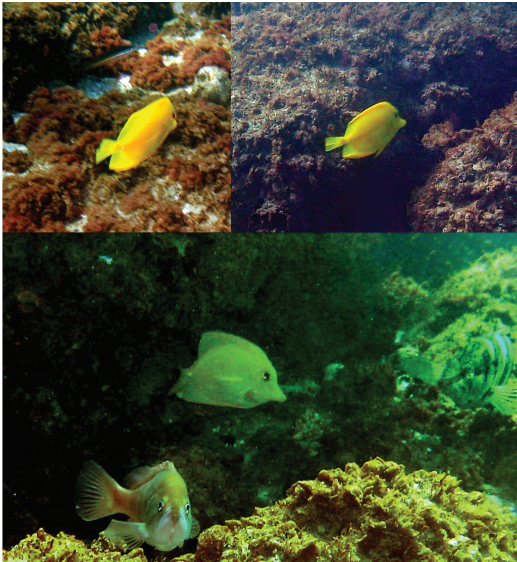
Fig. 1: Zebrasoma flavescens (Bennett, 1828) photographed off the coast of Sitges (Catalan Sea, Spain) on October 2008 at a depth of 6 metres.

The present findings from the Catalan Sea are the first documented occurrences of Z. flavescens and B. conspicillum in the Mediterranean. In the last few years, other exotic fish species have been documented from the Cata-