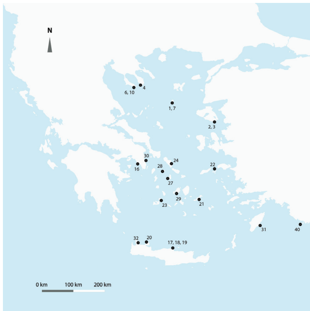
Fig. 1: Map showing the locations of marine caves for which new data are presented in this study (names of caves are given in the Footnote to Table 1).

67% of Gastropoda, 43% of Pisces, 37% of Hydrozoa, 33% of Decapoda, 28% of Polychaeta and 18% of Bivalvia).