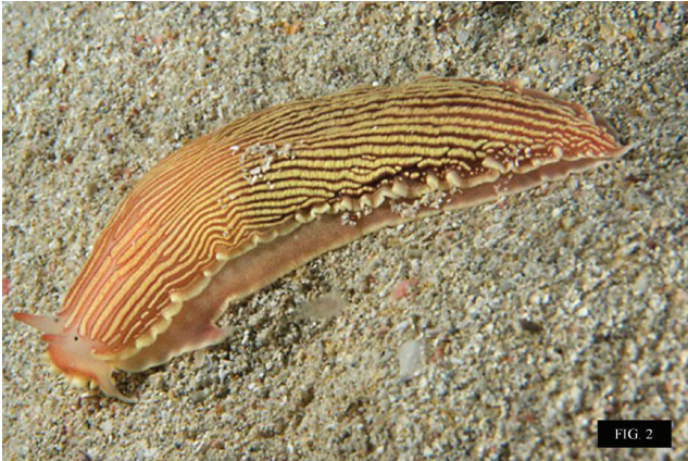
Fig. 2: Dermatobranchus cf. rubidus (Gould, 1852), Porto Pirrone, Italy, 31 October 2014, extended while crawling.