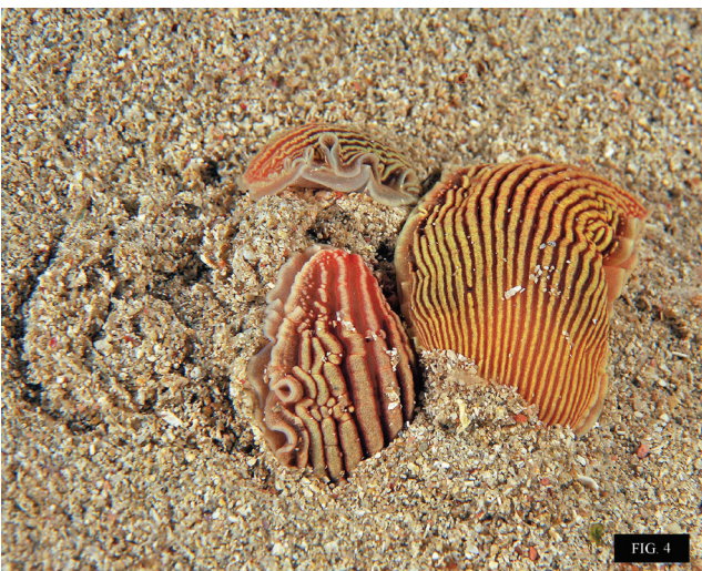
Fig. 4: Dermatobranchus cf. rubidus (Gould, 1852), Porto Pirrone, Italy, 31 October 2014, burrowing in sand soon after taking the flash photo of Fig. 3. (photo by Giovanni Colucci).