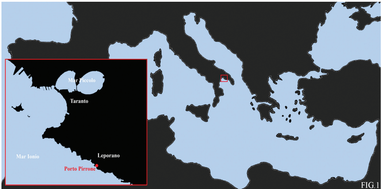
Fig. 1: Map of the area where the individuals were found.

rhinophores and going up to the posterior end of notum and at each side of it there were five other ridges. In the middle third of the body thinner ridges appeared, interleaved with the larger ones, so that in the central part of the back the total number of ridges was ten or eleven on each side. Rhinophores were close to one another, but well separated; they had a rounded tip with a series of thin longitudinal lamellae. The eyes were placed at the outer base of the rhinophores. The ground colour of different individuals showed lines from white to light yellow and the notum from burnt sienna to reddish brown, darker on the central part of the body. The mantle and the foot had a well-defined light margin and the rhinophores were light red. The sizes of the three individuals ranged from 40 to 80 mm (Figs. 2-4).