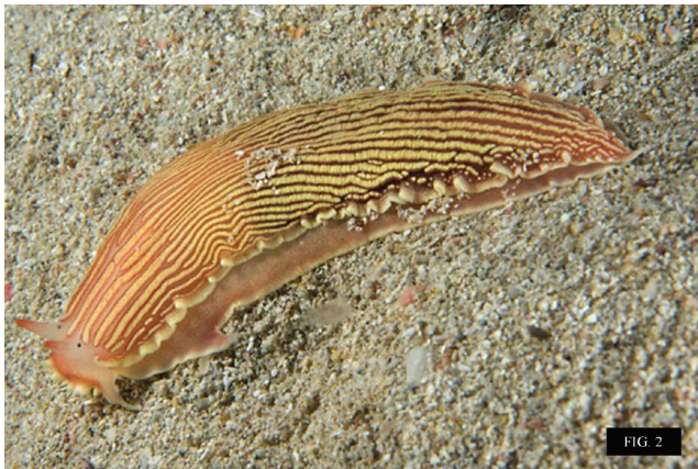
Fig. 2: Dermatobranchus cf. rubidus (Gould, 1852), Porto Pirrone, Italy, 31 October 2014, extended while crawling.