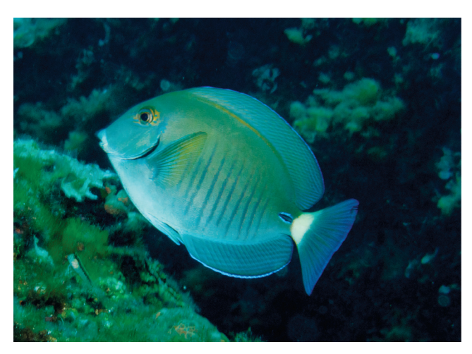
Fig. 1: The individual of Acanthurus chirurgus (~10 cm TL) observed at Elba Island on July 20, 2012 (Photo by M. Boyer).

body with a whitish ring on the caudal peduncle, and the characteristic 10 dark gray vertical bars on the posterior part of the flank reaching neither the dorsal nor the ventral edge. The unpaired fins show a thin but marked blue edge, and the dorsal and anal fins show several faint, oblique darker stripes. The peduncular spine shows a noticeable bright blue margin. This combination of characteristics allowed us to identify it univocally as A. chirurgus (Kuiter & Debelius, 2001). The fish was a young individual, about 10 cm TL, and appeared to be in good health.