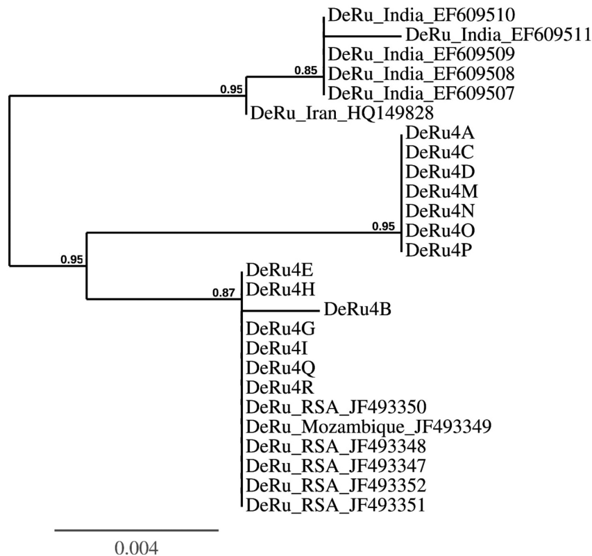
Fig. 3: Phylogenetic tree of Decapterus russelli . The 14 samples classified in this study are denoted by prefix DeRu4. Bootstrap values (n = 1000 replicates) are given for each node having 50% or greater support.

individuals are presented in brackets and denoted with a superscript letter “a” in Table S3. The closely related species are denoted with superscript letter “b”. For the highest similarity group, DNA barcoding and taxonomic classification in BOLD were in complete concordance with our respective data. For all 50 species, our presumptive taxonomic classification was exclusively or predominantly evident within the first threshold similarity group. The gap between the lower boundary of the first threshold group and the upper boundary of the second threshold group varied between species from 1 to 14%, with an average of 5.9% (Table S3). Nevertheless, the resolving power for identification of the presumptive species in the first threshold group and the related species in the second threshold group, with no overlap, was realized for only 16 of the 50 species (32%). For our samples that were classified to Lagocephalus guentheri , Oxyurichthys petersi , Sardinella aurita , and Torquigener flavimaculosus , there were two to three different taxonomic classifications within the first threshold group, one of which corresponded to our presumptive taxonomic classification. Conversely, for seven species, Diplodus annularis , Scomber colias , Ariosoma balearicum , Plotosus lineatus , Trichiurus lepturus , Synodus saurus and Raja miraletus , the same taxonomic name was evident in both the first and second threshold similarity groups. In the case of Callionymus filamentosus , there were more