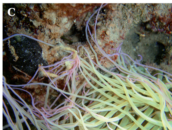
Fig. 2: A Regular resting position of Inachus phalangium with Anemonia viridis ; note tentacles not glued to the crab. B – C different I. phalangium attacked by A. viridis after introduction; note tentacles glued to various parts of crab body.

posited as reference specimens in the 'Arthropoda varia' collection at the Zoologische Staatssammlung München.