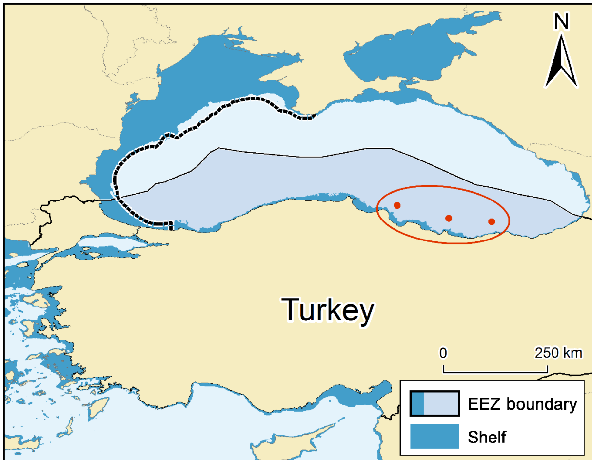
Fig. 1: Regions from which the fishery catches used in this study originated. The 3 dots in the Southeast Black Sea document the three points whose SST values were averaged to obtain a SST trend characterizing the core area of Turkish fisheries in the Black Sea. The dotted line separates what Shapiro et al. (2010) call the colder “deep Black Sea” from the warmer “Western shelf” of the Black Sea.

The Turkish catches from these two areas consisted of N = 88 species and/or higher taxa (henceforth ‘species’) for which trophic levels and preferred temperatures were available or could be inferred (Table 1a for fishes and Table 1b for invertebrates in Supplementary Material), as required for the calculation of the MTI and MTC indices.