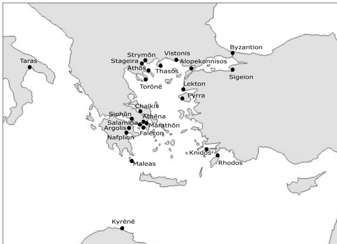
Fig. 3: Coastal locations from which marine animals are reported by Aristotle in his biological works. Aristotle's birth place (Stageira, Macedonia) is also included.