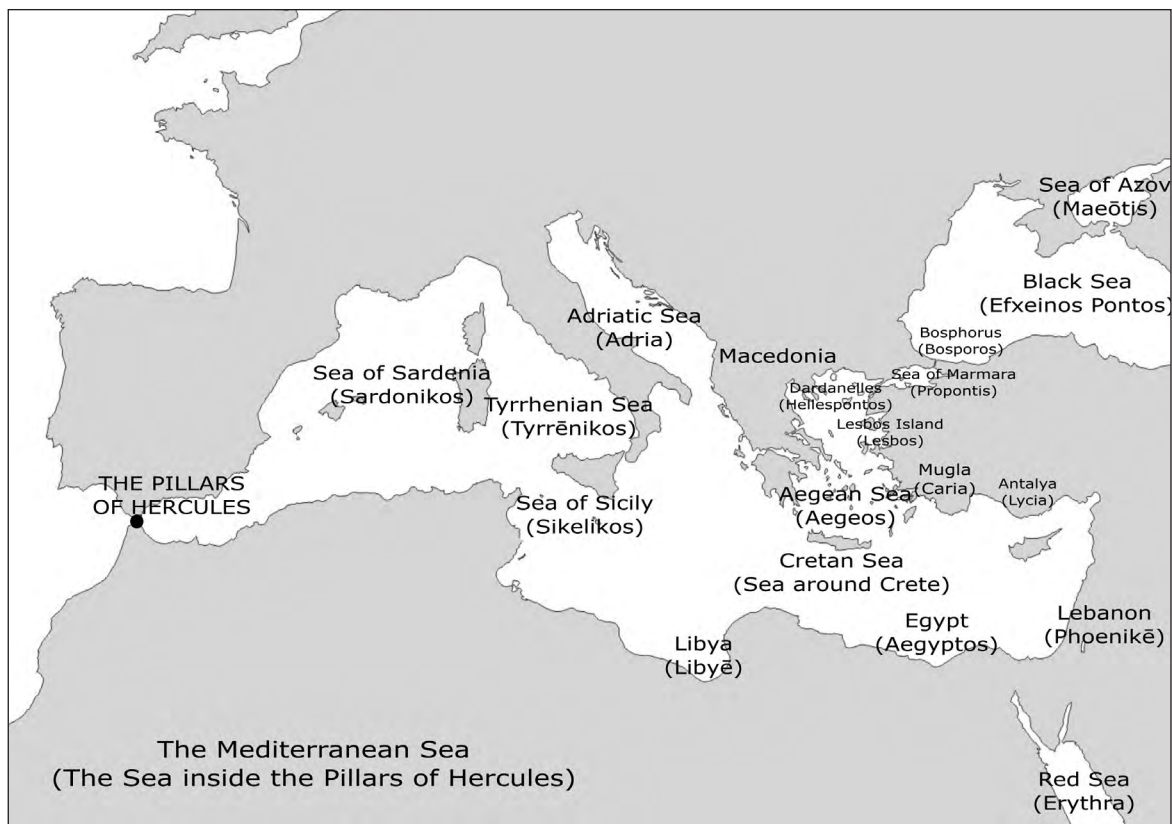
Fig. 4: Geography of the Mediterranean Sea according to Aristotle based on his Meteorologica and biological works.