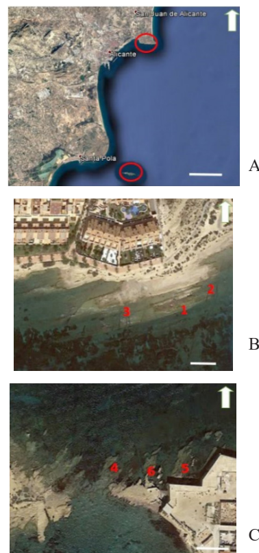
Fig. 2: Sampling locations. A. Geographic location of both areas (northern circle indicating Cabo de las Huertas, and southern circle indicating Isla de Tabarca); scale bar = 5 km. B and C. Transect locations at Cabo de las Huertas and Isla de Tabarca respectively (scale bar = 30 m). Modified from Google Earth.

i) Substrate slope angle, from 0 up to 4: (0) horizontal surface; (1) 15–30° slope; (2) 30°–45° slope; (3) 45°–90° slope; (4) >90^{\circ} slope.