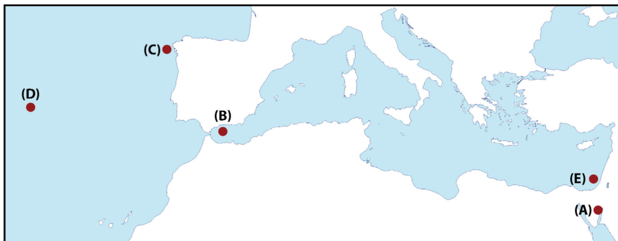
Fig. 1: Mediterranean and its surrounding observations of Fistularia petimba . (A) Red Sea (Dor 1984); (B) Mediterranean Spain (Cárdenas & Berastegui 1997); (C) Atlantic Spain (Bañón & Sande 2008); (D) Azores Islands (Azevedo et al. 2004); (E) Israel (this study).