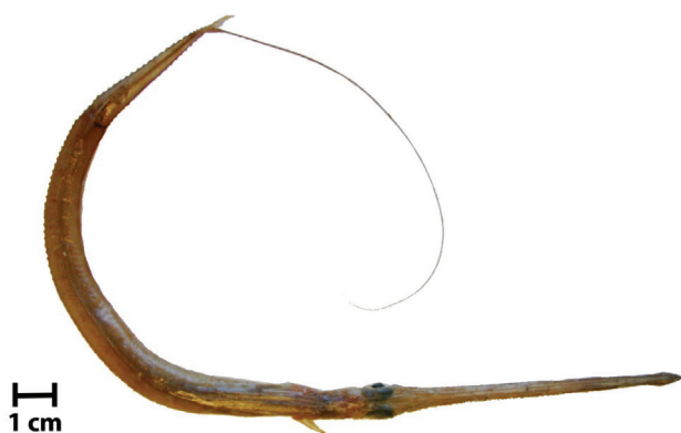
Fig. 2: Fistularia petimba Lacepède, 1803. Ashdod, Israel. SMNHTAU P. 15902.

the Steinhardt Museum of Natural History in Tel Aviv University (SMNHTAU) under the voucher number SMNHTAU P. 15902.