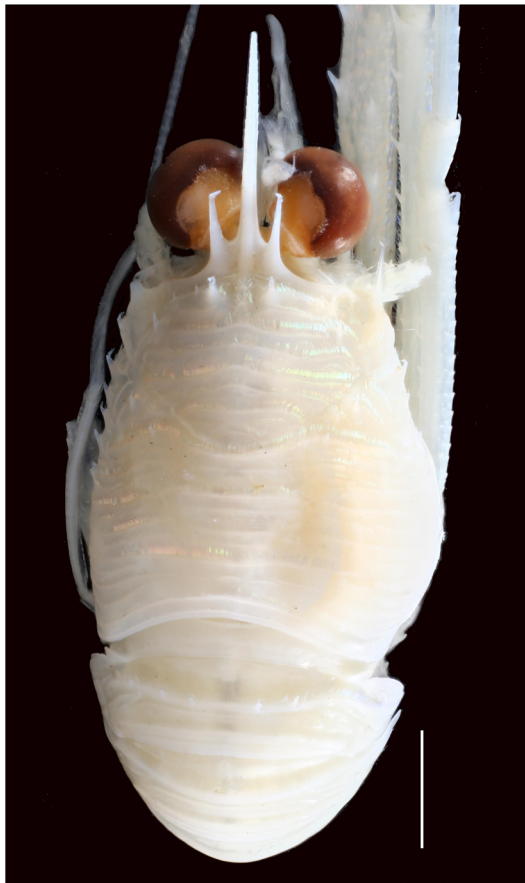
Fig. 1: Munida rutllanti Zariquiey Alvarez, 1952, dorsal view of male specimen (USNM 1492241) with swollen right branchial chamber caused by Anuropodione amphiantra (Codreanu, Codreanu & Pike, 1966) n. comb. Scale bar = 3 mm.

4b. Lateral plates of pleon overlapping ... A. amphiantra (Codreanu, Codreanu & Pike, 1966) n. comb. [Mediterranean Sea: Algeria to Turkey; Adriatic Sea, 60-400 m depth, infesting Munida rutllanti Zariquiey Alvarez, 1952].