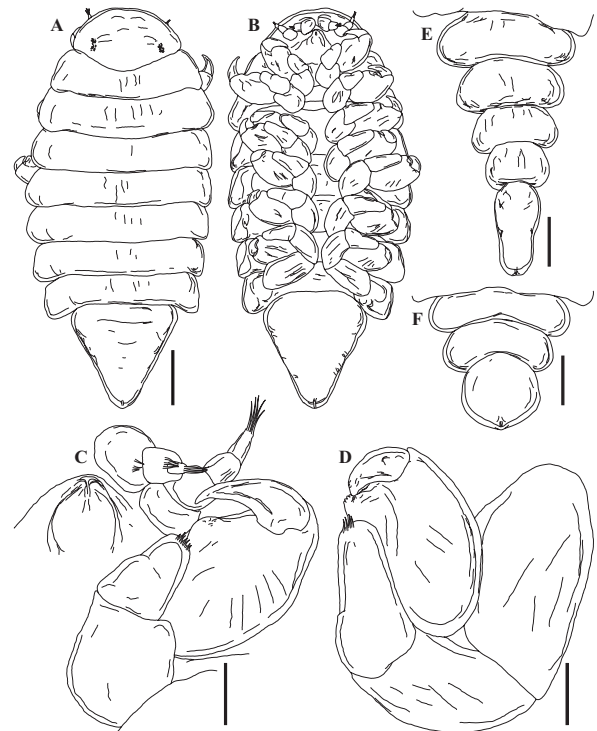
Fig. 4: Anuropodione amphandra (Codreanu, Codreanu & Pike, 1966) n. comb., male specimens USNM 1492250 (A-D), USNM 1492279 (E), USNM 1492241 (F). A, dorsal view. B, ventral view. C, mouthparts, left antennule (top), left antenna (bottom) and left pereopod 1. D, left pereopod 7. E, pleon with 5 segments. F, pleon with 3 segments. Scale bars = 250 \mu m (A, B, E, F), 50 \mu m (C, D).

in March 2017 or August 2018 (USNM 1492241; Fig. 1) (all other specimens cited below with same collection data); 1 dextral ovigerous female (8.6 mm), 1 mature male (4.8 mm, pleon elongate with 5 pleomeres), from right branchial chamber of unknown sex and size M. rutllanti (USNM 1492244); 1 dextral ovigerous female (7.5 mm), 1 mature male (1.7 mm, pleon short with all pleomeres coalesced), from right branchial chamber of unknown sex and size M. rutllanti (USNM 1492250); 1 sinistral ovigerous female (7.0 mm), 1 mature male (pleon elongate with 5 pleomeres), from left branchial chamber of unknown sex and size M. rutllanti (USNM 1492279); 1 dextral ovigerous female (5.5 mm), 1 mature male (pleon short with all pleomeres coalesced), from right branchial chamber of male M. rutllanti (15 mm CL) (USNM 1492233); 1 dextral ovigerous female (7.3 mm), infesting unknown size and sex M. rutllanti (MNHN-IU-2017-72).