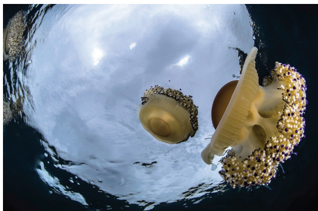
Fig. 2: Cetylorthiza tuberculata.

Humans could exploit the increase of jellyfish by de-