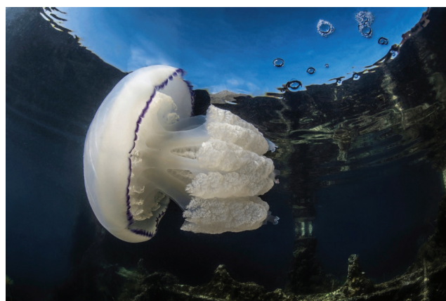
Fig. 3: Rhizostoma pulmo.