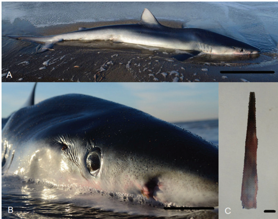
Fig. 2: 'A': blue shark ( Prionace glauca L.) stranded in the coast of Ostia province (West Italy, western Mediterranean) with a swordfish ( Xiphias gladius L.) rostrum piercing its skull. Scale bar indicates 50 cm. 'B': details of the bill's incision close to the right eye. Scale bar indicates 5 cm. 'C': details of the fractured swordfish rostrum. Scale bar indicates 2 cm.