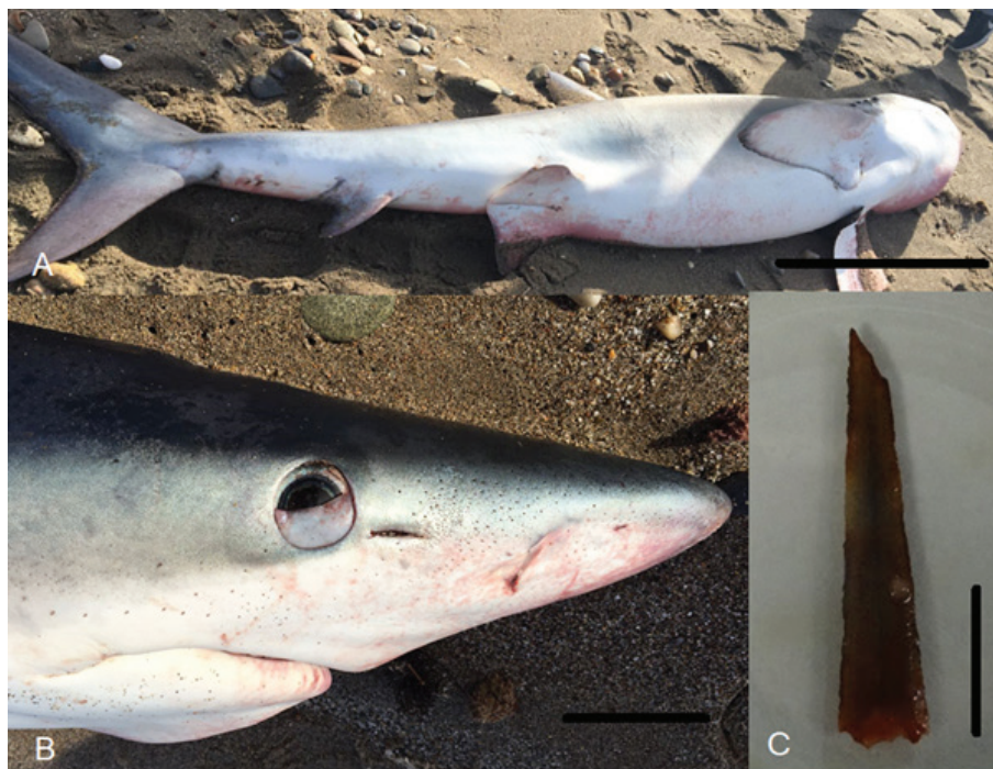
Fig. 3: 'A': blue shark ( Prionace glauca L.) stranded in the coast of Vera (East Spain, western Mediterranean) with a swordfish ( Xiphias gladius L.) rostrum piercing its skull. Scale indicates 50 cm. 'B': details of the bill's incision close to the right eye. Scale bar indicates 5 cm. 'C': details of the fractured swordfish rostrum. Scale bar indicates 2 cm.

calculated for each case in relation to the distance from the tip to the breaking point. To add further correction, we observed the arrangement of the paired nutrient canals at the breaking point, as shown in cross sections, to compare it with a swordfish analysed by Habegger et al. (2015). The allometric regression between TSL and body length (BL), from post operculum to tail fork, was obtained following McGowan (1988).