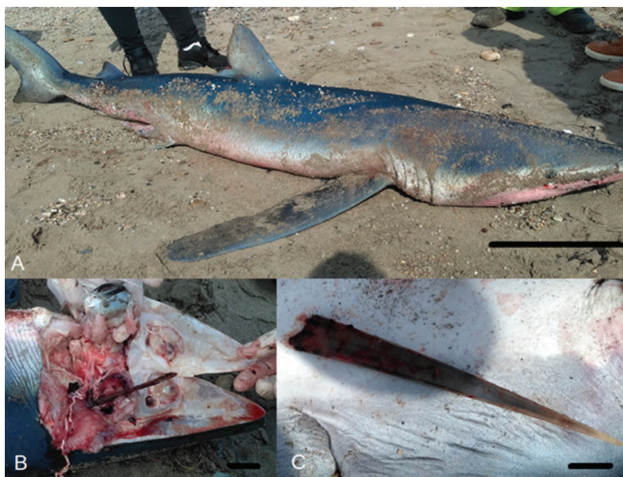
Fig. 1: 'A': Blue shark ( Prionace glauca L.) stranded in the coast of Garrucha (East Spain, western Mediterranean) with a swordfish ( Xiphias gladius L.) rostrum in its skull. Scale indicates 50 cm. 'B': details of the bill stuck close to the left eye. Scale bar indicates 5 cm. 'C': details of the fractured swordfish rostrum. Scale bar indicates 2 cm.

Rostrum fragments were identified as belonging to a swordfish ( X. gladius ) based on the following combination of features (Fierstine & Voigt 1996, Penadés-Suay et al. 2017): (1) flattened appearance in cross-section (i.e., depth less than half of width); (2) absence of denticles on the surface, and (3) presence of central chambers in cross-section. To estimate swordfish total body length (TL), the ratio of maximum width to length of the fragment (R) was calculated. Then, the rostrum of two swordfish specimens conserved at the Osteological Collection of the Department of Zoology, University of Valencia, were used to obtain the points in which the value of R was equal to the value obtained in each case (Penadés-Suay et al. 2017). Assuming an isometric relationship in the growth of the snout, total snout length (TSL) was