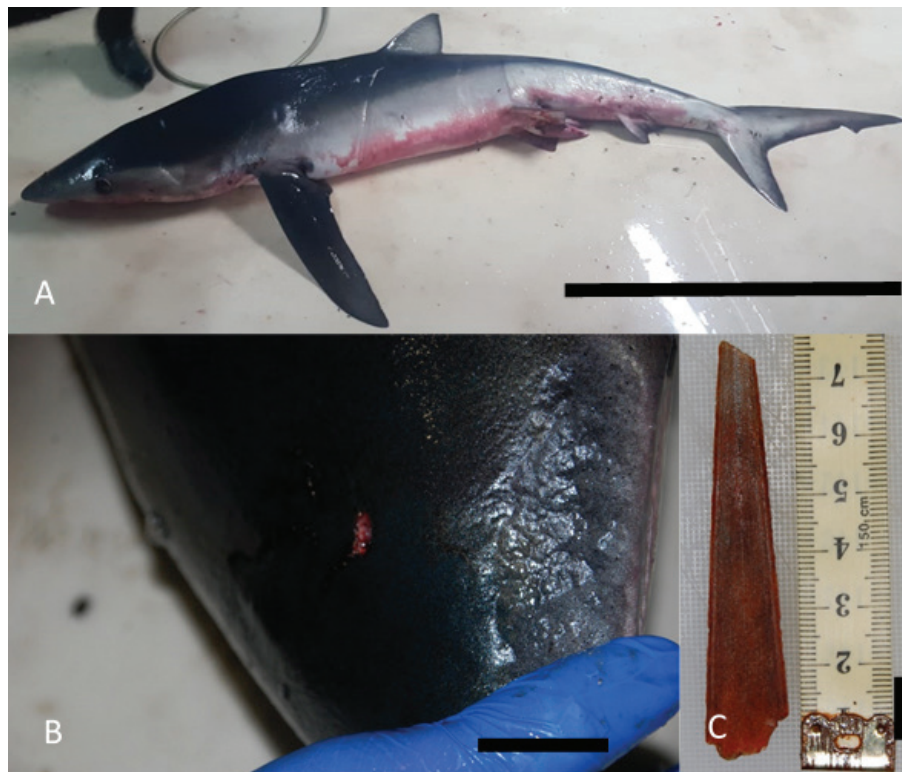
Fig. 5: 'A': blue shark ( P. glauca L.) stranded on the coast of Manacor (Balearic islands, western Mediterranean) with a swordfish ( Xiphias gladius L.) rostrum piercing its snout. Scale indicates 1 m. 'B': details of the bill's incision close to the centre of the snout. Scale bar indicates 5 cm. 'C': details of the fractured swordfish rostrum. Scale bar indicates 1 cm.

above, swordfish frequently displays pugnacious behaviour, even towards prima facie non-threatening species, including humans (Smith 1956, Georgiadou et al. 2010, Ellis 2013). Secondly, in all cases of impalement on blue sharks reported so far (Penadés-Suay et al. 2017; present study), the angle of piercing indicates a nearly horizontal strike with respect to the sharks' anteroposterior axis. Although there is no reason to exclude the possibility of an accidental collision during an act of predation to the same prey, a voluntary offense to the blue shark by juvenile swordfish is to be considered, given that the type of impalement described could hardly result from random collisions. Finally, at least the shark stranded in the coast of Vera showed signs of two diverse interactions with swordfish happened at different times, which would refer to two swordfish interactions.