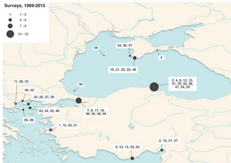
Fig. 1: Location of the 59 ichthyoplankton surveys performed in the Eastern Mediterranean (Levant and Aegean Seas) in the Black and Marmara Seas from 1989 to 2014 and further documented in Table 1.