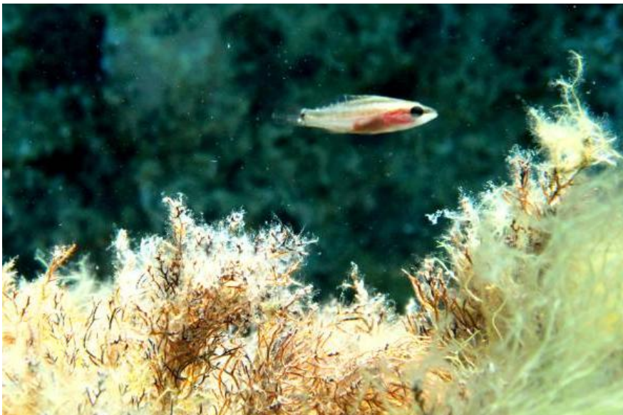
Fig. S1c: Transitory behavior of a juvenile of Serranus scriba (40 mm TL, July 2010).