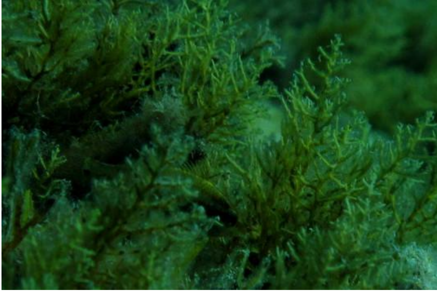
Fig. S1a: Cryptic behavior of a juvenile of Symphodus ocellatus (45 mm TL, September 2013).