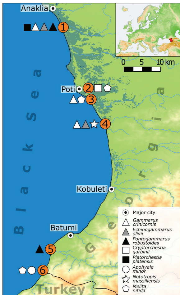
Fig. 1: Map of the sampling localities along the Black Sea coast in Georgia. Symbols represent families, and shades represent species (triangles: Gammaridae, squares: Talitridae, circles: Hyalidae, stars: Atylidae, pentagons: Melitidae).

scope and identified using appropriate keys (Ruffo et al. , 1993; Grintsov & Sezgin, 2011; Krapp-Schickel & Sket, 2015). Photographs were taken with a Nikon D90 camera equipped with an AF Tamron 70–300 mm F/4–5.6 lens, a Raynox DCR-250 macro attachment, and a Delta DRF-14 flash.