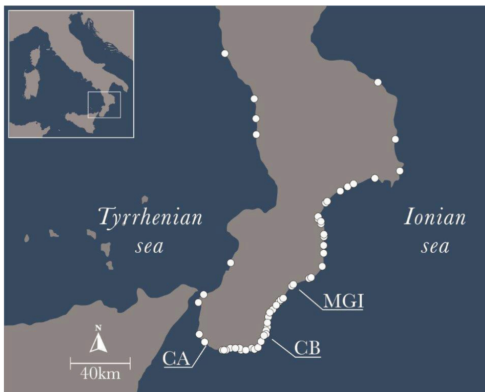
Fig. 1: Nest distribution of loggerhead turtle along the Calabrian coasts for the 2016-2020 reproductive seasons. Each white dot corresponds to a single nest. (CA: Capo d'Armi; CB: Capo Bruzzano; MGI: Marina di Gioiosa Ionica).