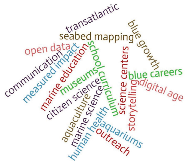
Fig. 2: European Marine Science Educators Association (EMSEA) conference topics.

to promote the sustainable management of its resources and to promote OL with their citizens. OL is a framing and foundational concept of the Galway Statement and as such, it was cross-cutting among all Priority Areas of the Atlantic Ocean Research Alliance (AORA). An OL Working Group was established and charged with defining a strategic path forward for Transatlantic Ocean Literacy, to be informed by international stakeholders representing ocean science, formal and non-formal education, government, marine education, business, industry and policy (Papathanassiou et al. , 2018). The AORA Ocean Literacy Working Group sought alignment and collaboration among key strategic partners working in Canada, the US and the EU to support implementation of Transatlantic Ocean Literacy as conceptualized in the