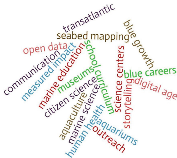
Fig. 2: European Marine Science Educators Association (EMSEA) conference topics.

to promote the sustainable management of its resources and to promote OL with their citizens. OL is a framing and foundational concept of the Galway Statement and as such, it was cross-cutting among all Priority Areas of the Atlantic Ocean Research Alliance (AORA). An OL Working Group was established and charged with defining a strategic path forward for Transatlantic Ocean Literacy, to be informed by international stakeholders representing ocean science, formal and non-formal education, government, marine education, business, industry and policy (Papathanassiou et al. , 2018). The AORA Ocean Literacy Working Group sought alignment and collaboration among key strategic partners working in Canada, the US and the EU to support implementation of Transatlantic Ocean Literacy as conceptualized in the