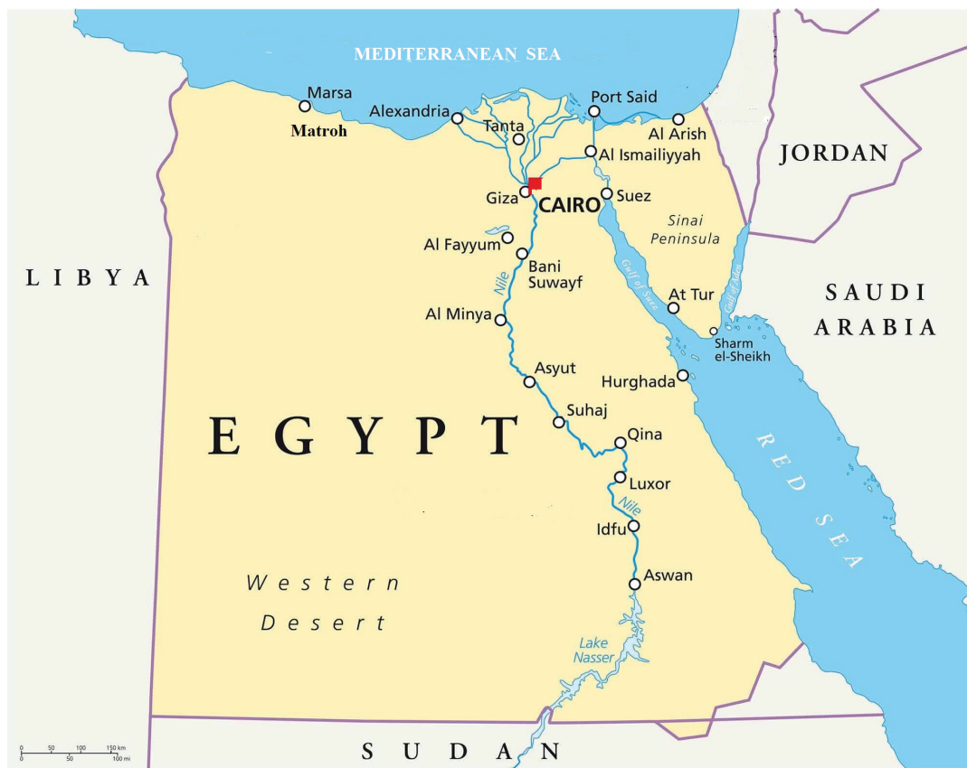
Fig. 1: Egyptian coast of Mediterranean Sea.

identification sheets. The specimens were preserved frozen and transferred to the laboratory for further investigation. Morphometric and meristic characteristics as well as most diagnostic features were recorded and counted with a digital caliper. Body measures were presented in proportion to standard length (SL). The following measurements were taken: