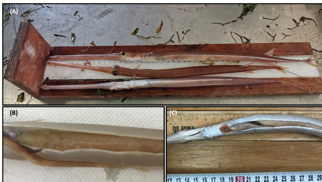
Fig. 1: (A) Fistularia petimba specimens caught in June 2020 from the MEDITS bottom trawl survey in Cyprus; (B) Gonads of a mature/spawning female individual; (C) Mullus barbatus (TW = 0.77 g) inside the stomach of a female Fistularia petimba (TLF = 598 mm; TL = 415 mm; SL = 404 mm; FL = 411 mm; TW = 41.86 g; Stage: Mature/Spawner).

The large F test-statistics and correspondingly the very small p values for males, females, and combined sexes for all four log-transformed length measurements indicate that the linear regression models with both intercepts and log-transformed length measurements explain more of the variability in the log-transformed weight than a model with just an intercept. This explains that all four log-transformed length measurements for both sexes and for combined sexes are significant predictors of the log-transformed weight. Also, the very small p values ( < 0.001 ) indicate that the slope is significantly different than zero, which shows that there are significant relationships between the log-transformed total weight and the log-transformed length measurements for both and combined sexes. The simple linear regressions and ANOVA tests of the four different log-transformed length measurements with log-transformed total weight are shown in Table S3.