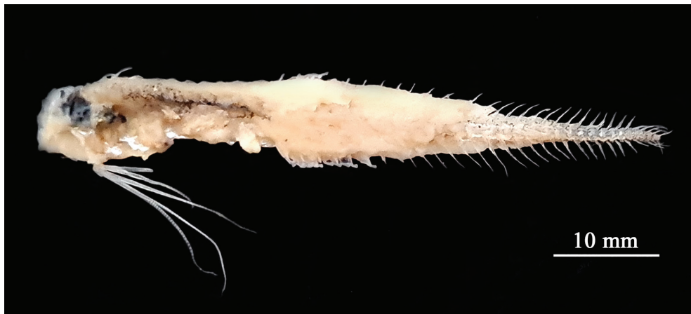
Fig. 1: Specimen of small-scale codlet B. nectabanus found in the stomach contents of M. merluccius , sampled in the northern Ionian Sea.

virgin developing female (TL 315 mm, TW 230 g); the stomach contents, in addition to B. nectabanus , contained one specimen of Alpheus glaber and one of Sardina pilchardus . These stomach contents were also in medium/low degree digestion.