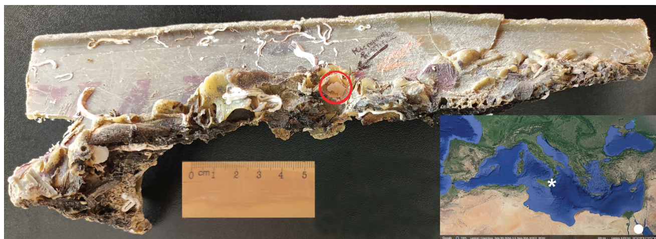
Fig. 1: Microporella hastingsae Harmelin, Ostrovsky, Cáceres-Chamizo and Sanner, 2011 on its plastic substratum collected at the Simeto river-mouth (Sicily, Ionian Sea). The sole colony is indicated within the red circle. Known distribution of the species in the inset. Asterisk: present colony; solid circle: previous records in northern Red Sea and the southern entrance of the Suez Canal.

Collected items included an irregularly shaped plastic fragment (possibly the edge of a fruit box), partly burned and solidified after melting, around 20 x 8 x 5 cm in size (Fig. 1). Plant remains, serpulid tubes, encrusting ostreid valves and Anomia adhesion thickenings, byssate (arcid) molluscs, barnacles and encrusting foraminifera fouled this item together with few bryozoan colonies. The latter