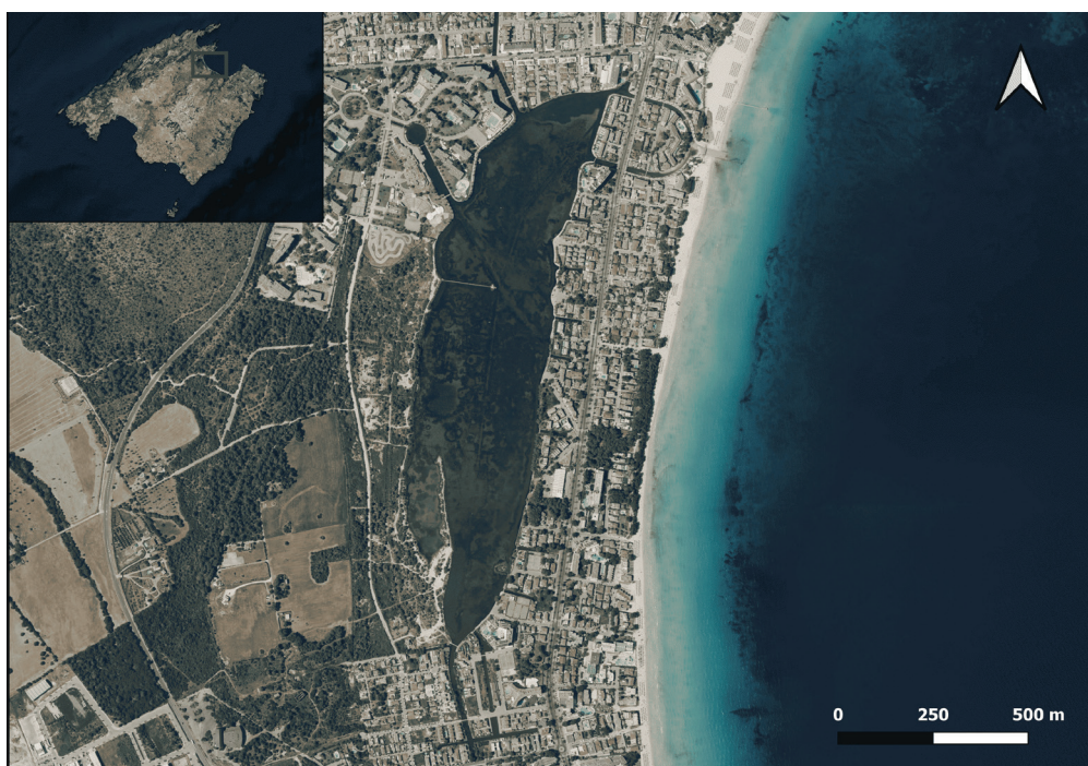
Fig. 1: Study area and finding location of Phyllorhiza punctata .

The DNA extraction was carried out on samples of tissue using the commercial Macherey-Nagel DNA Tissue extraction kit (Düren, Germany), following the manufacturer’s instructions. The quality and concentration of the DNA were measured using the Nanodrop ND1000 (Thermo Scientific, Waltham, MA, USA).