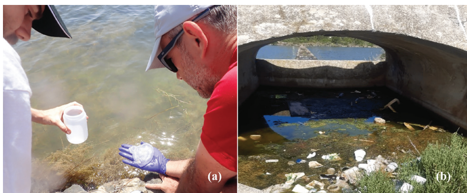
Fig. 2: Data collection during surveys within the study area. A-Sample collection of Phyllorhiza punctata adult individual. B-Example of anthropogenic waste found during the surveys.

For species identification, a fragment of approximately 650 bp of the mitochondrial cytochrome c oxidase subunit I gene (barcoding) was amplified by PCR and sequenced using the universal primers HCO2198-LCO1490 (Folmer et al. , 1994). PCR reactions were performed in a total volume of 20 \mu L containing 10 \mu L KAPA Taq Ready Mix PCR kit (Sigma-Aldrich, Burlington, MA, USA), 0.4 \mu L of each primer (stock 20 \mu M), and 1 \mu L of DNA (20 up to 80 ng/ \mu L) and water to make up the final volume. The temperature protocol consisted of an initial denaturation step at 94 ^{\circ} C for 2 min, and 40 cycles of 94 ^{\circ} C for 30 s, 50 ^{\circ} C for 20 s, and 72 ^{\circ} C for 1 min. PCR products were separated on 1.5% agarose in TAE 1x buffer gels, including a HighRanger 1 kb DNA ladder size standard, stained with GelRed (Biotium, Fremont, CA, USA) (Norgen, Thorold, Canada), and visualized on a UV transilluminator.