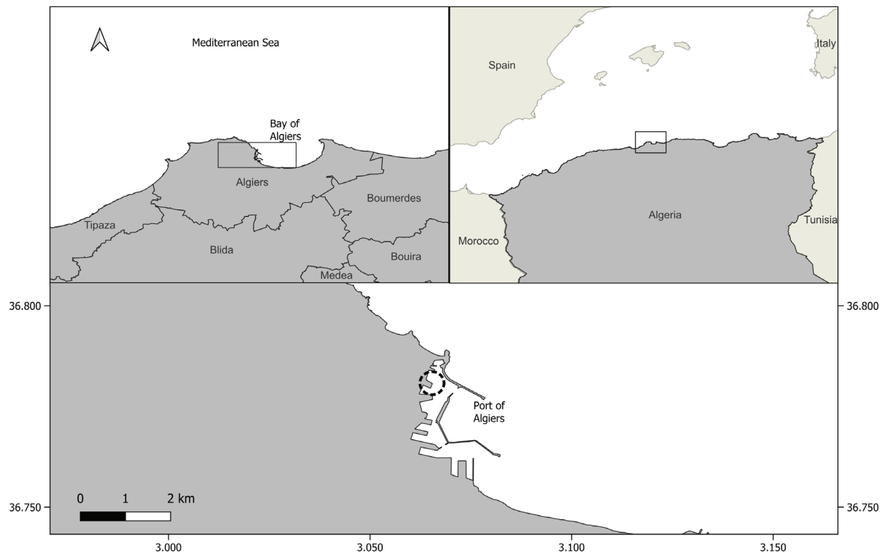
Fig. 1: Location of the study site (area outlined with dashed lines) within the Port of Algiers.

Some specimens were identified on-site, which were recognised based on clearly visible morphology. Other specimens were identified using a stereomicroscope and a microscope in the laboratory, while additional identifications were made from photographs. Species identified through photographs or on-site were generally ascidians. Taxonomic keys and expert knowledge were used to identify specimens to the lowest feasible taxonomic level. The nomenclature of identified species was verified according to the World Register of Marine Species (WoRMS Editorial Board, 2024).