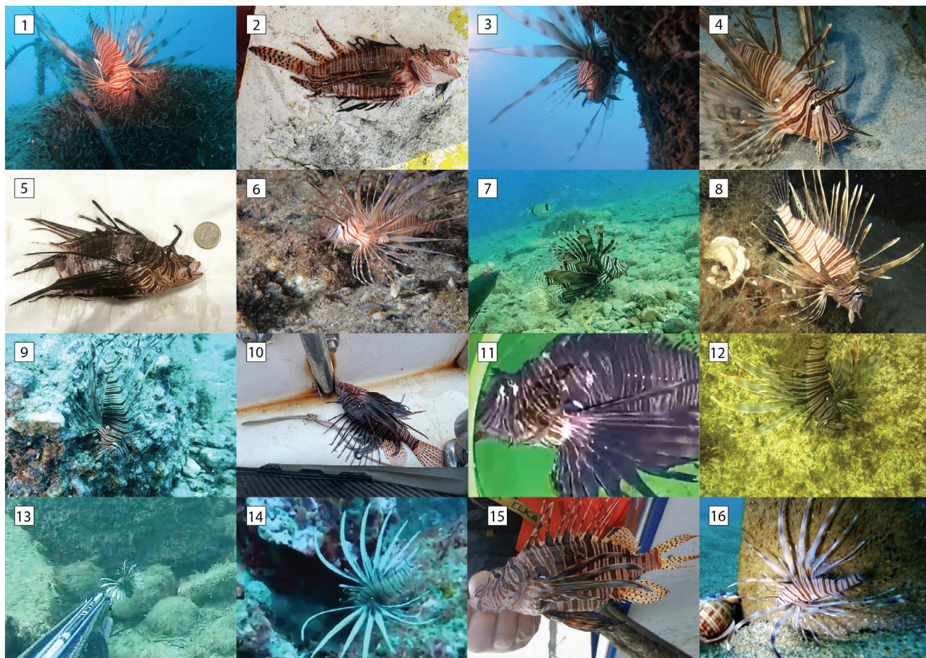
Fig. 1: Composite images illustrating the 16 Pterois miles sightings listed in Table 1. Each photograph is labeled with the corresponding Record ID from Table 1, highlighting the verified observations documented during the Attenti a quei 4! campaign.