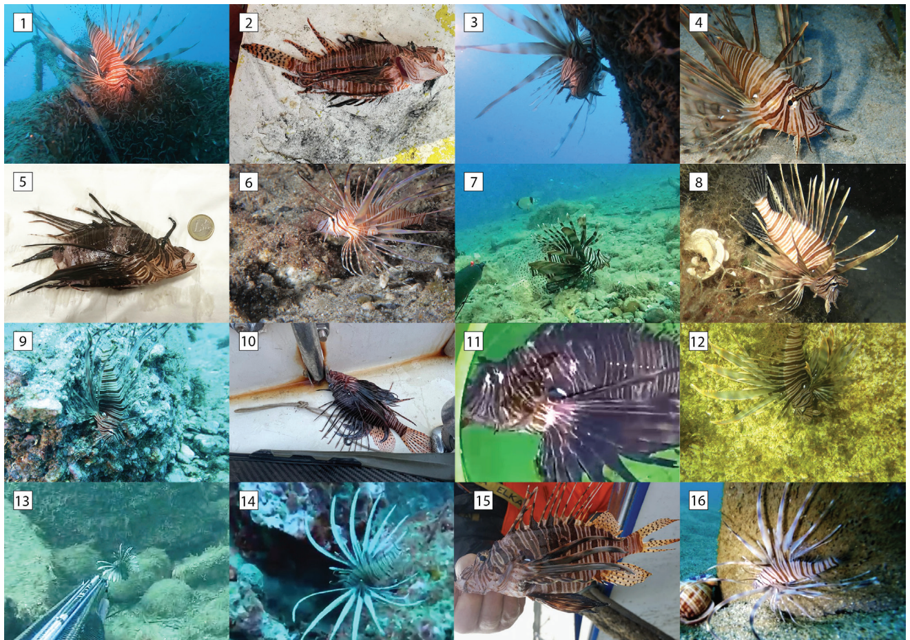
Fig. 1: Composite images illustrating the 16 Pterois miles sightings listed in Table 1. Each photograph is labeled with the corresponding Record ID from Table 1, highlighting the verified observations documented during the Attenti a quei 4! campaign.