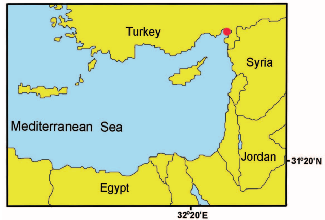
Fig. 1: Map of the area with location of the sampling station.

This study reports the presence of a further alien gastropod mollusc, Pseudorhaphitoma iodolabiata Hornung & Mermod (1928), which was recently recorded in the Levantine Sea.