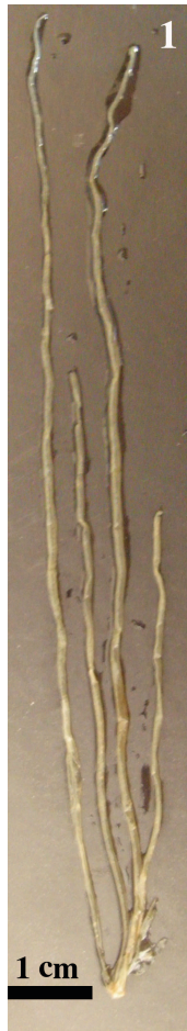
Fig. 1: Scytosiphon dotyi . General view of plant.